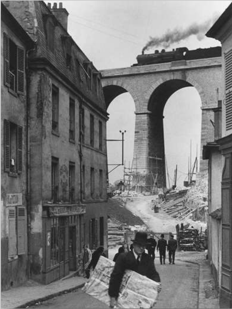
Andre Kertesz, Meudon, France, 1928