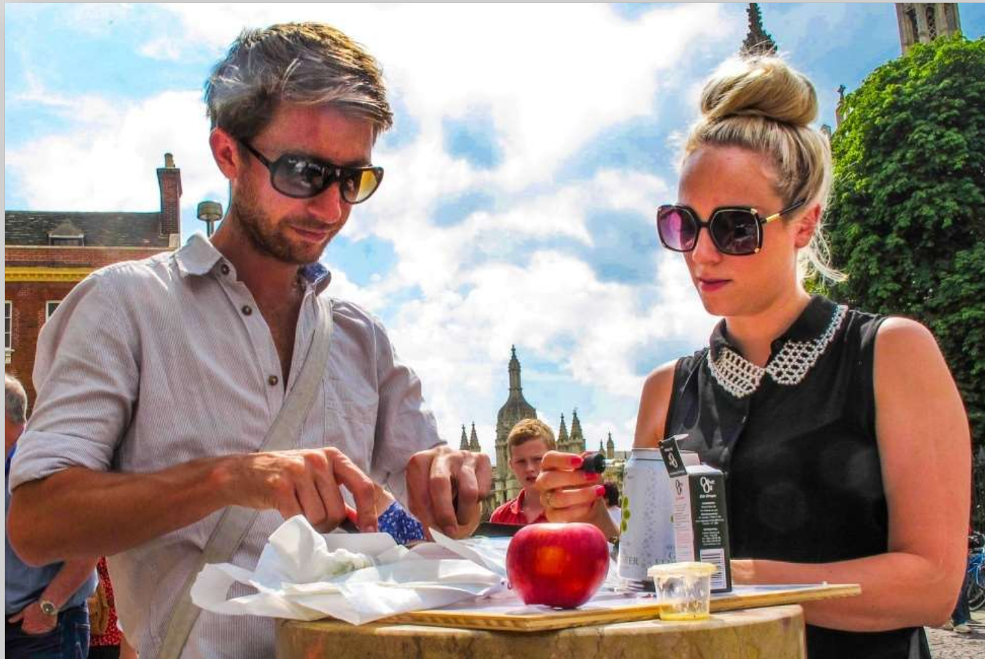
Senate House Hill, Cambridge, 2012