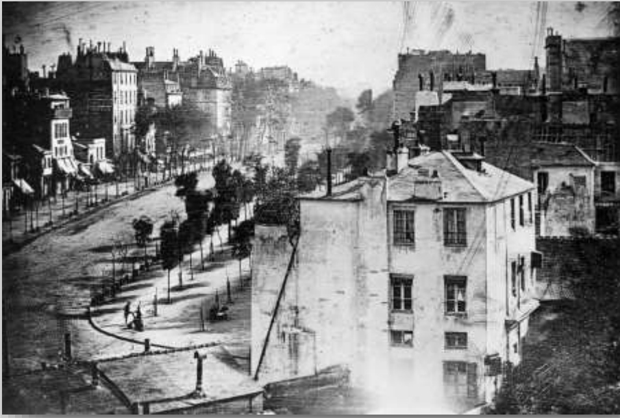
Boulevard du Temple, Louis Daguerre, 1838