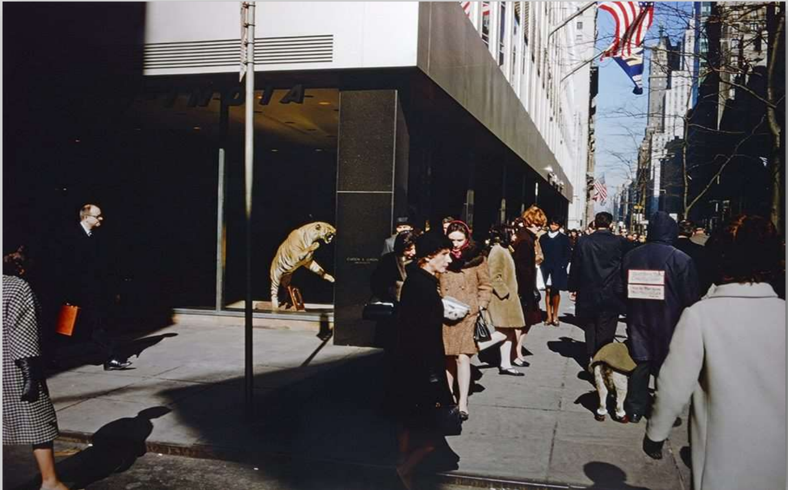
Joel Meyerowitz, New York City , 1975