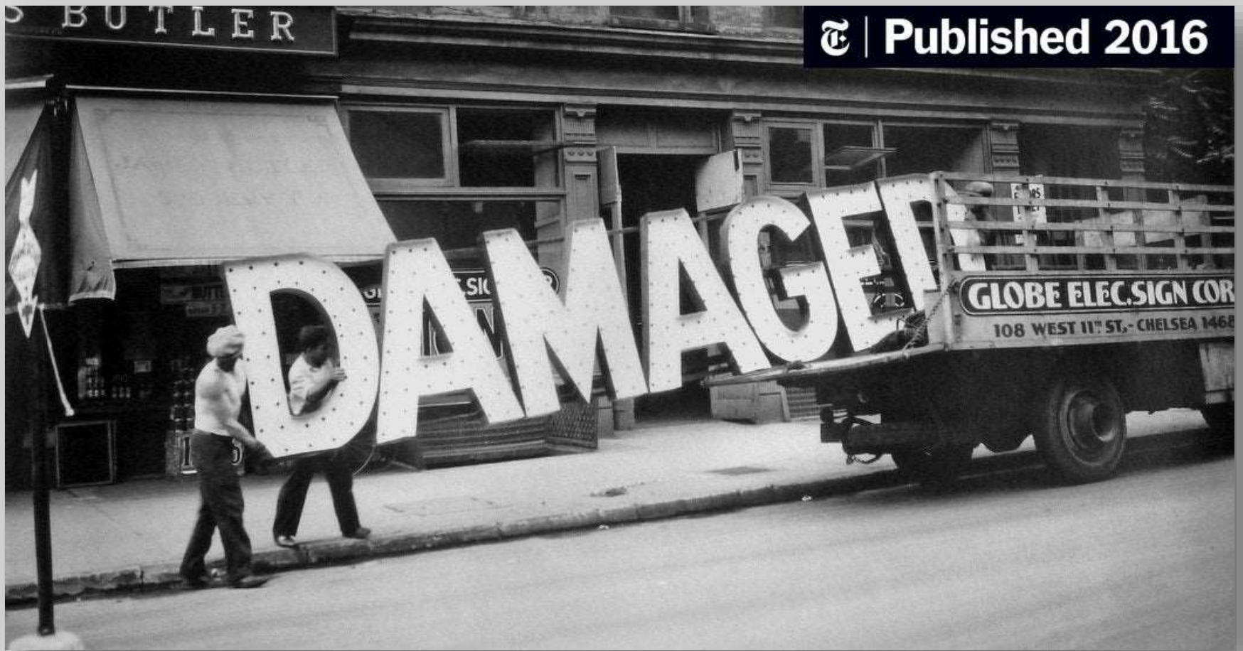
Walker Evans, Damaged , 1928-30