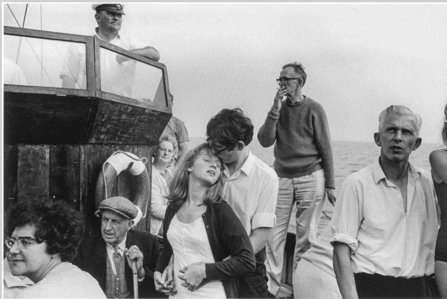
Tony Ray-Jones, Beachy Head, Tripper Boat , 1967