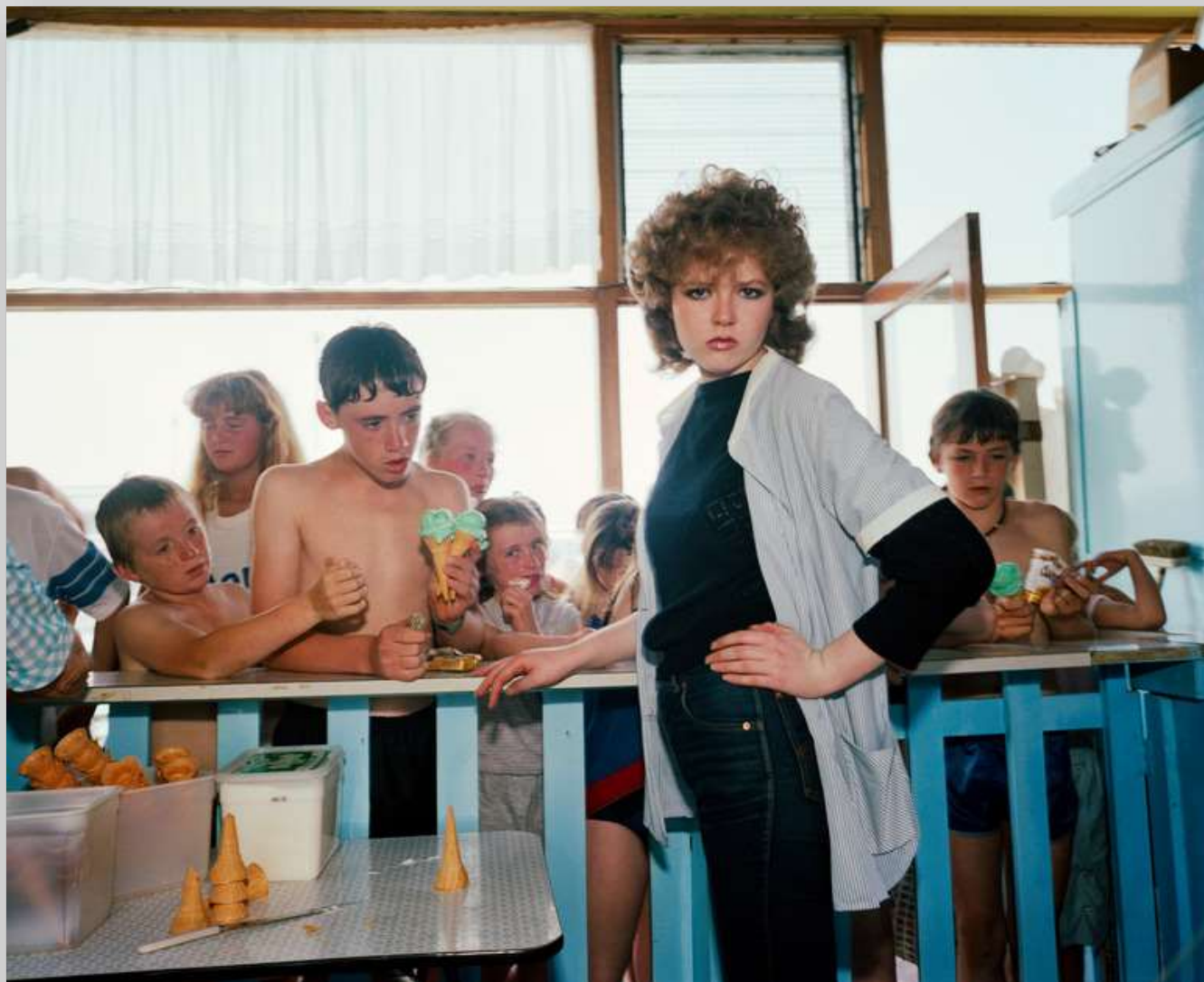
Martin Parr, New Brighton , 1983-85