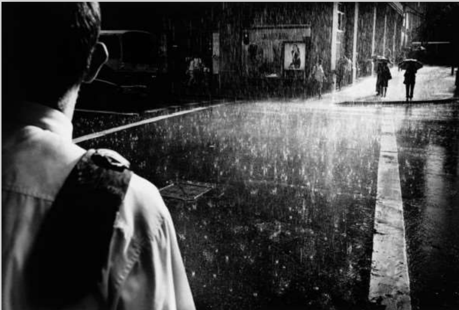
Trent Parke, Sydney, Australia , 1998