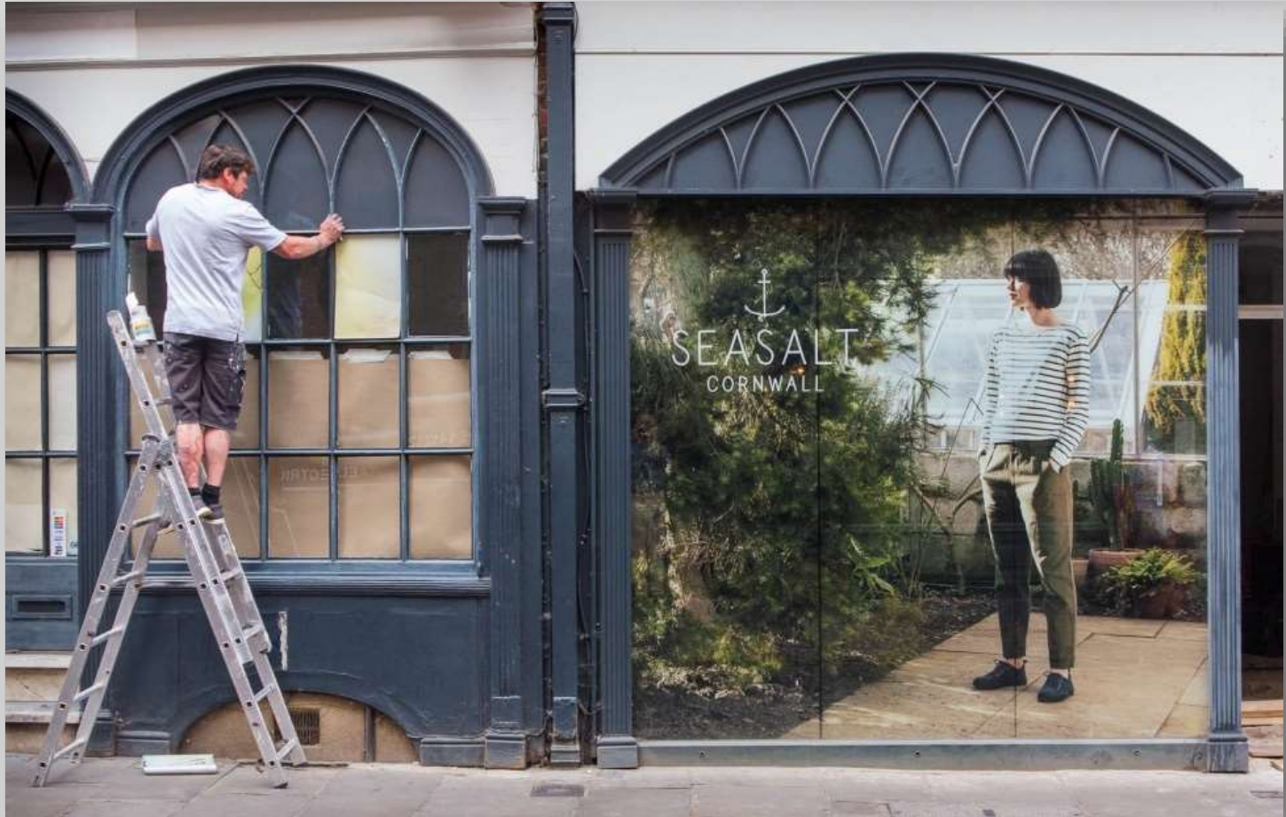
Trinity Street, Cambridge, 2018