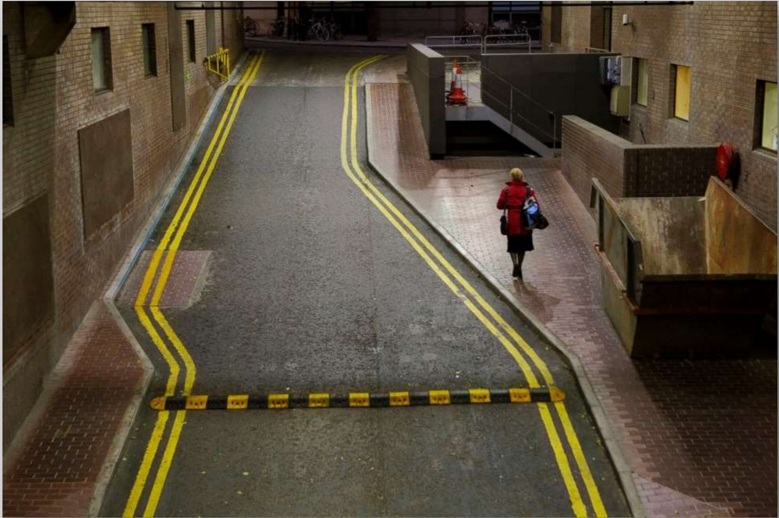
Harry Gruyaert, London 2012