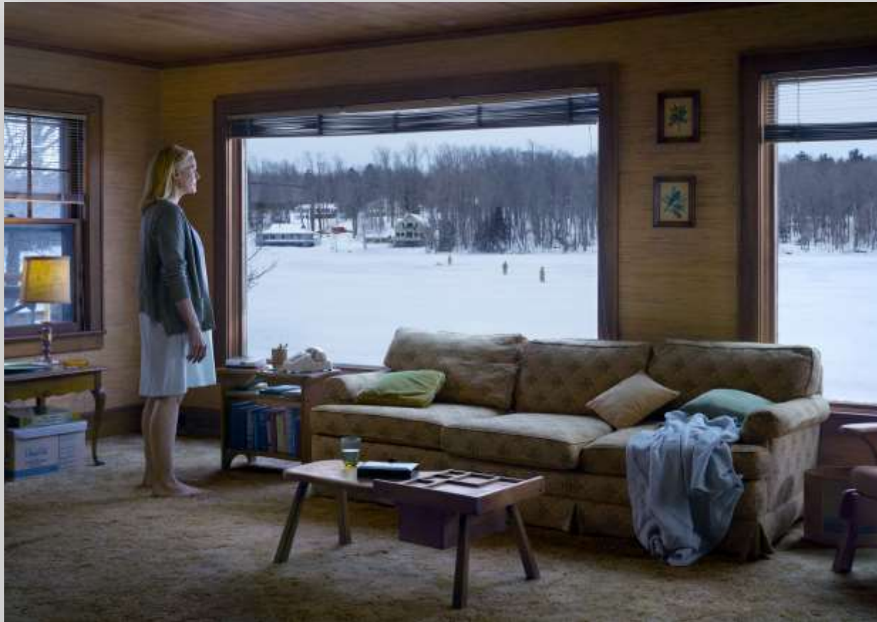
The Disturbance , Gregory Crewdson, 2014