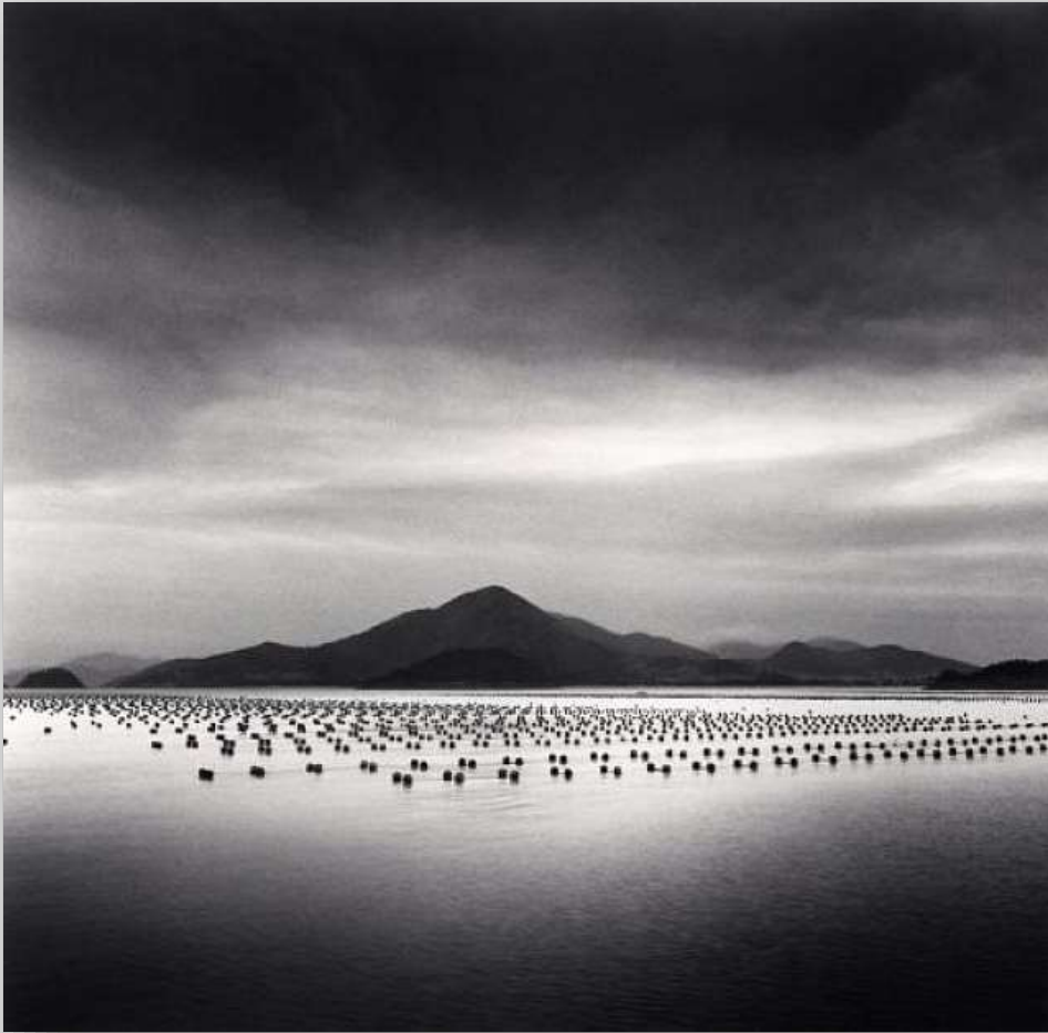
Lines of seaweed, Michael Kenna, 2012