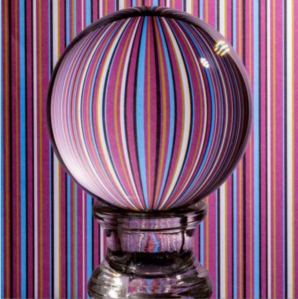
Lens Ball, Don Fleet