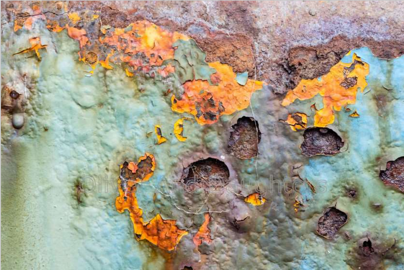
AB Rust No 6, Oliver and daughters, nd