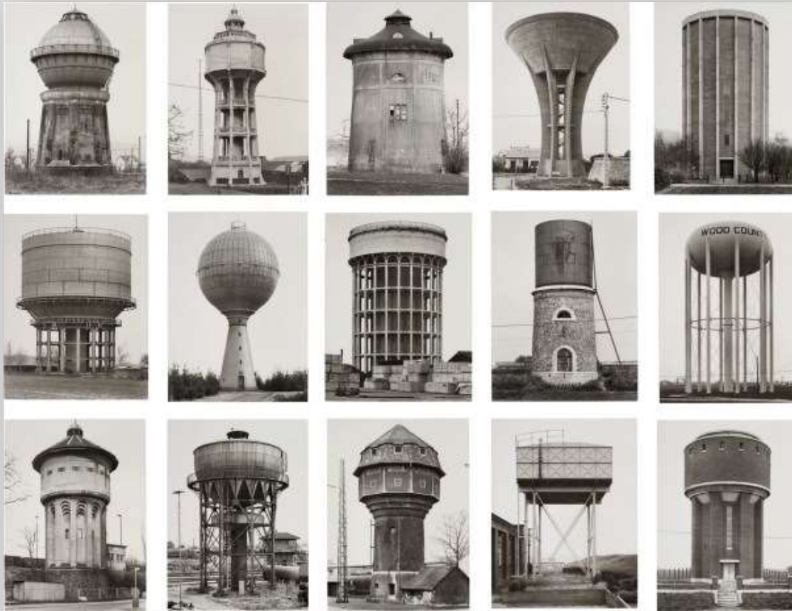
Water Towers, Bernd and Hilla Becher, 1965-1997