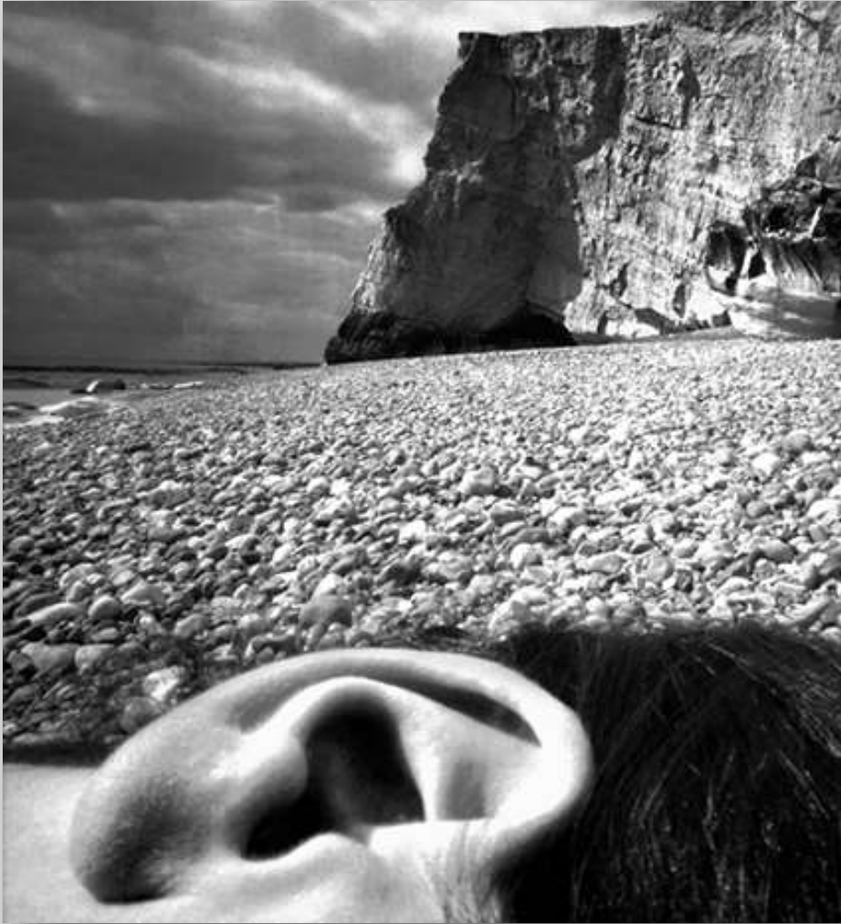
Ear on the Beach, Bill Brandt, 1957