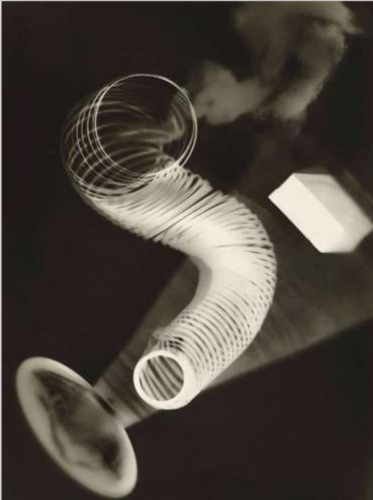
Rayograph/photogram, Man Ray, 1920s